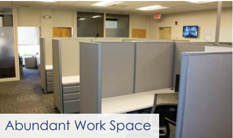
Abundant Work Space